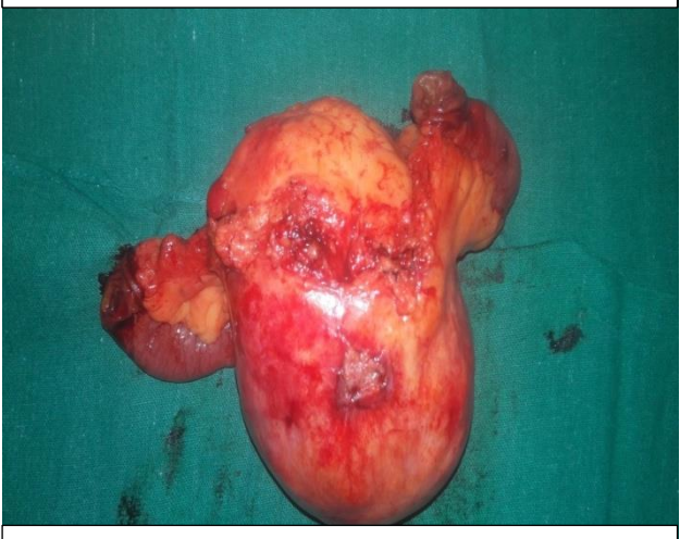
Figure 3. Excised jejunal mesenteric cyst with adjacent bowel.