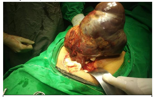
Figure 1. Intra-operative photograph showing large right ovarian cyst, after detorsion.

One 12 years old female patient was referred from gynaecology department with large abdomino-pelvic lesion with clitoromegally (Figure 4). CECT abdomen and pelvis was done before intervention. In view of absence of peritonism and fever with exclusion of hydatid disease, percutaneous pigtail catheter drainage was done under local anaesthesia under ultrasonographic guidance. About two litres of pus drained, symptoms improved and distension subsided. Patient is being evaluated for disorders of sexual development (DSD).